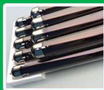
3 Layer Tube