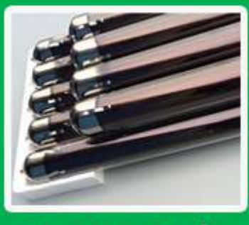
3 Layer Tube